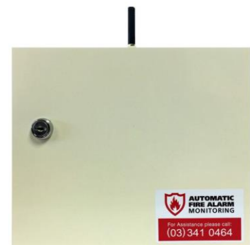
Compact Customer Terminal Unit (CTU) provided and installed at customers premises

Signals from your fire alarm system are processed and forwarded directly to the Fire & Emergency NZ on secure dual path links, while information about the site events are simultaneously provided to the associated fire alarm/sprinkler service maintenance company.